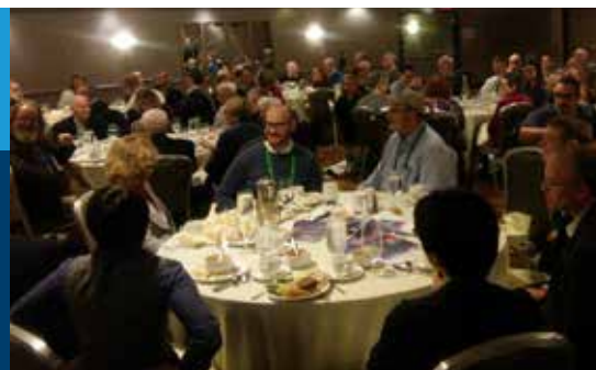
Alumni enjoyed reconnecting at the SBL luncheon.

I am reminded of something that comes up over and over as I meet with PSGS alumni and as I work in academic publishing. Friends, we are a productive crowd! We are publishing in academic journals and with academic publishers; we are speaking at academic conferences and volunteering in the academy; we are located across the globe and in some places clustered in the same institution; we are consulted for all types of projects that find their way into the mainstream; and we are distinguished leaders in our various fields. So be encouraged this day as you work in the classroom, as you minister, and as you continue to pursue academic excellence in your research and writing. You are in good company!