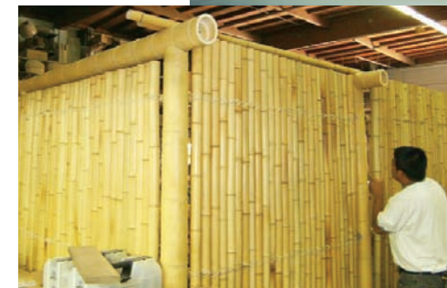
Construction of the new Cedars-Sinai sukkah .