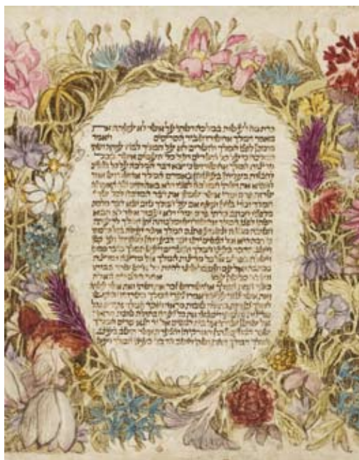
Illuminated Esther Scroll, V, 5, 17th century; Klau Library, Cincinnati

(Director of Libraries HUC-JIR, 1996 to the present)