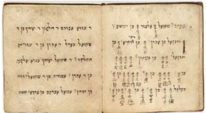
Chinese-Hebrew Memorial Book, HUC Ms. 926, 17th century; Klau Library, Cincinnati