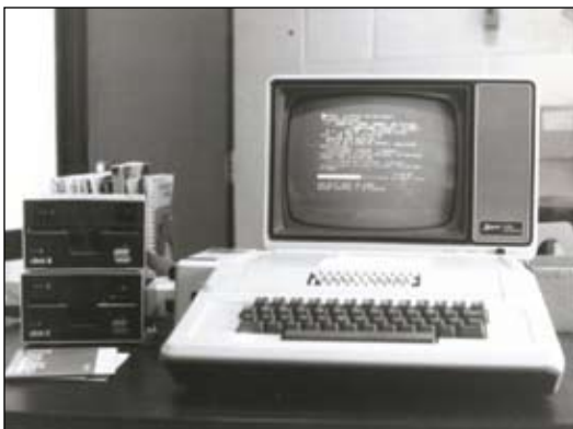
The Apple II+ computer that enabled the Klau Library to be the first American library to process bilingual Hebrew-English cataloging in 1983.

Another level of our library's activity is to reach out beyond our students and faculty as