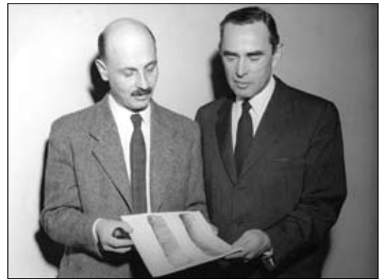
Archaeologist Yigael Yadin (left) and HUC-JIR President Nelson Glueck with a page of the Dead Sea Scrolls Security Copy.