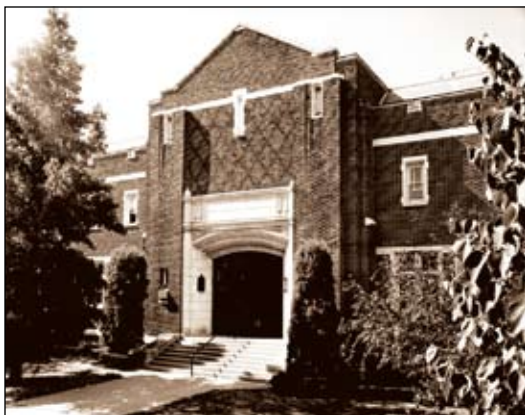
HUC Library, Clifton Campus, 1931.

into the greatest library of the ancient world.