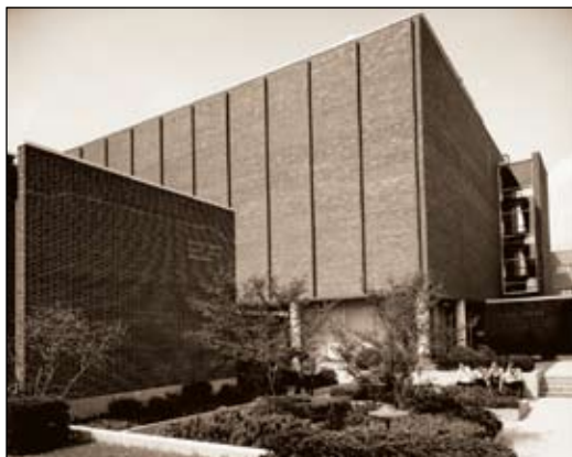
Klau Library, Clifton Campus, 1961.

contributed $50,000, the Hebrew Union College in 1912 could dedicate as its library the building which is today the basis for the Jacob Rader Marcus Center of the American Jewish Archives. Remarkably, in all of Jewish history and all the Jewish world it was the first building devoted entirely to a Jewish library.