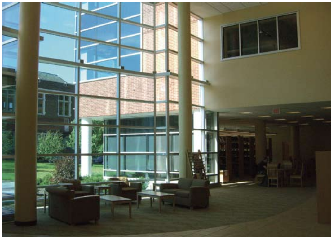
Interior, The Jewish Foundation of Cincinnati Pavilion, Klau Library

of wine fall upon a very old haggadah, can it not be said that that very drop has brought a worn haggadah new life? It has joined once more in celebrating the occasion that its pages recount.