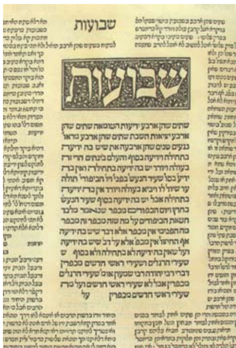
Talmud Shevu'ot, Venice: Daniel Bomberg, 1520/21; Klau Library, Cincinnati