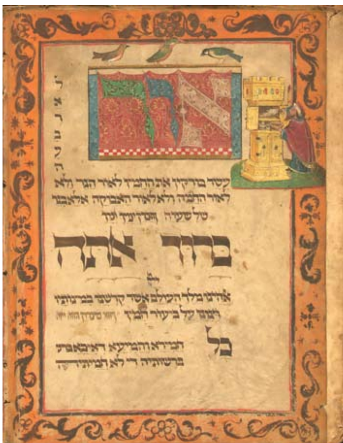
First Cincinnati Haggadah, HUC Ms. 444, 1480–90; Klau Library, Cincinnati