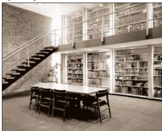
Dalshemer Rare Book Room and Building, Klau Library, Clifton Campus, 1961.