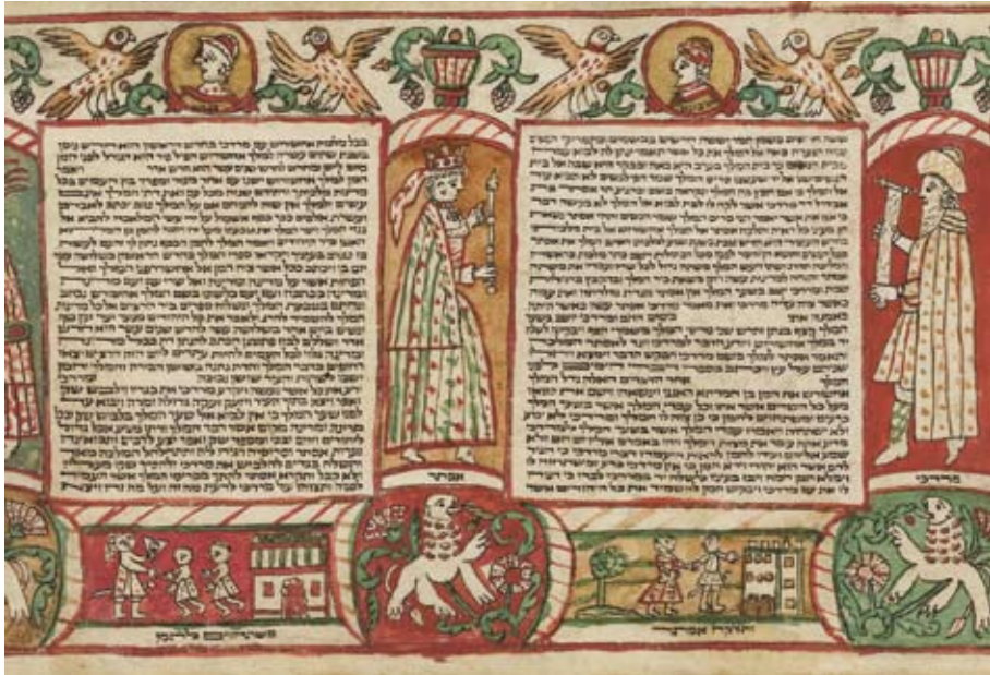
Illuminated Esther Scroll, III, 9, 18th century; Klau Library, Cincinnati

mandated that the contents of these important documents be protected from any possible disaster. Our library served that purpose.