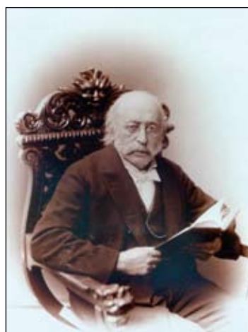
Rabbi Isaac Mayer Wise

When in 1880 Isaac Mayer Wise reported to the Board of Governors on the College's tiny library, he told them: "Five years more in the same ratio [of acquisitions] will give you the largest and best appointed Jewish library in the country; and the library is the soul of the College." In the magnificent new Library of the Hebrew Union College-Jewish Institute of Religion that we dedicate today we do indeed have the "largest and best appointed Jewish library in the country." And – most important – along with its smaller sister libraries in New York, Los Angeles, and Jerusalem, it continues to be the soul of the College.