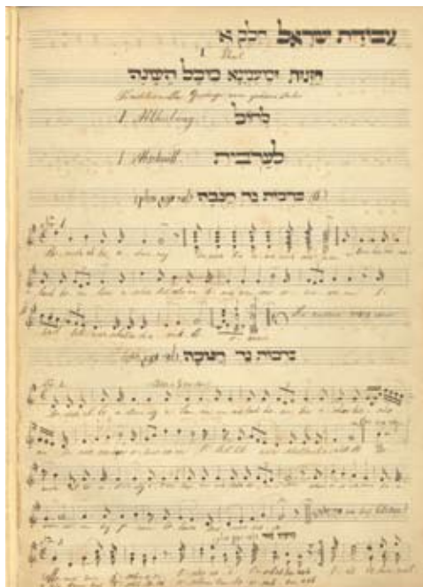
Avodat Yisrael, Birnbaum Music Collection, Ms. 39 (2), 19th century; Klau Library, Cincinnati