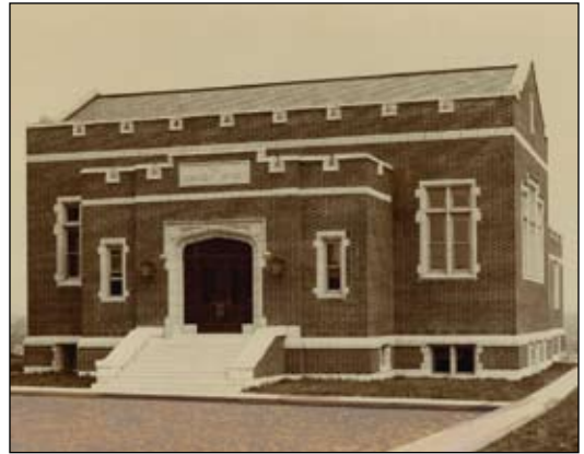
Bernheim Library, Clifton Campus, 1912.

The granddaddy of all libraries was the remarkable structure built in Alexandria, Egypt during the reign of the Hellenistic monarch Ptolemy Philadelphus in the third century B.C.E. The Apocryphal Letter of Aristeas re-