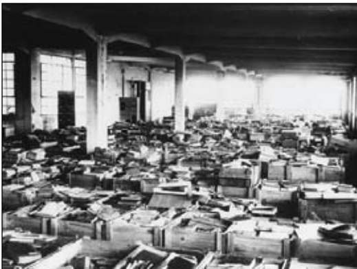
The depot of Jewish books and archival materials confiscated by the Nazis and liberated by the Allies.