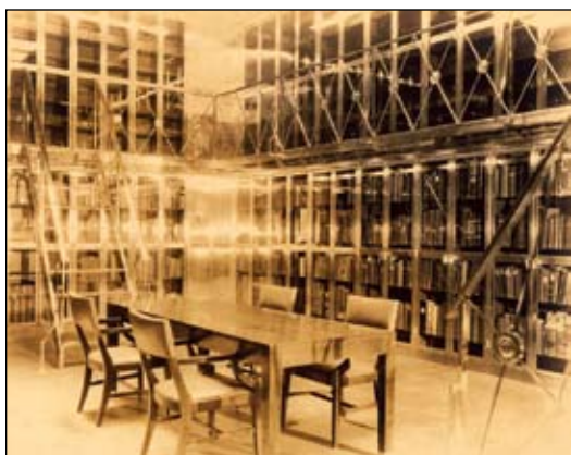
Rare Book Room, HUC Library, Clifton Campus, 1931.